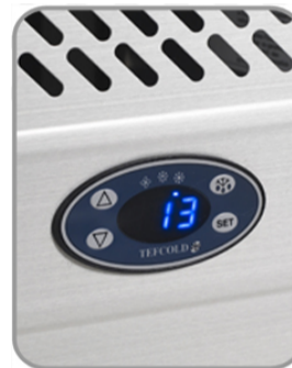
Soft touch controller with clear blue display