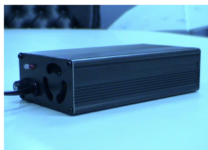
3A ~ 12A Charger